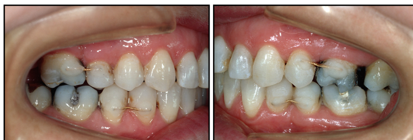
Fig 2. Short 0.0215-in wire labial retainers bonded over 2 neighboring teeth are useful to retain closed premolar extraction sites and preserve approximated teeth after space closure.

The maxillary canines normally settle themselves optimally into occlusion with removable retention devices.